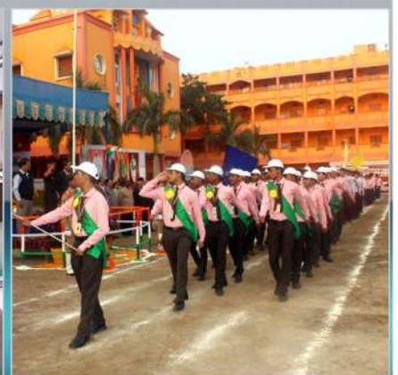
Republic Day Parade - 2019